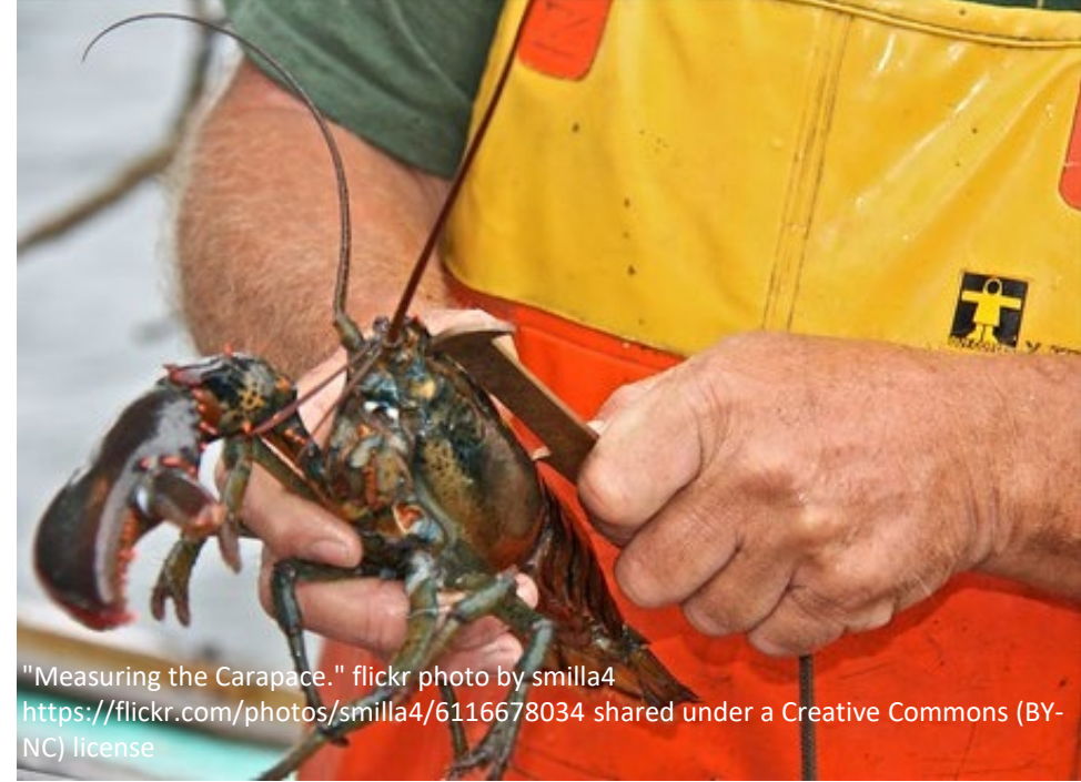
"Measuring the Carapace."