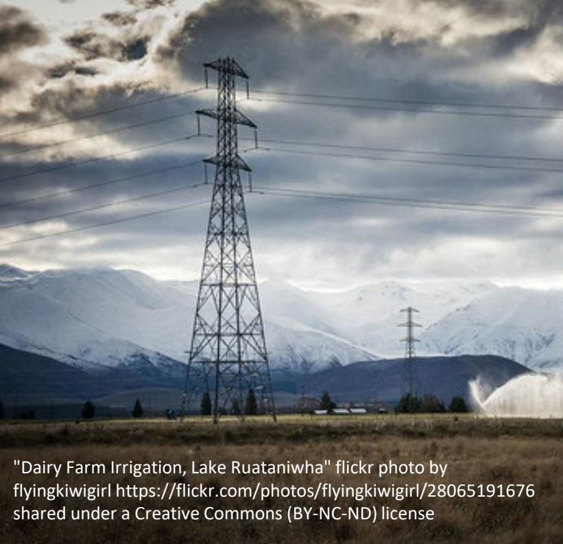
"Dairy Farm Irrigation, Lake Ruataniwha"