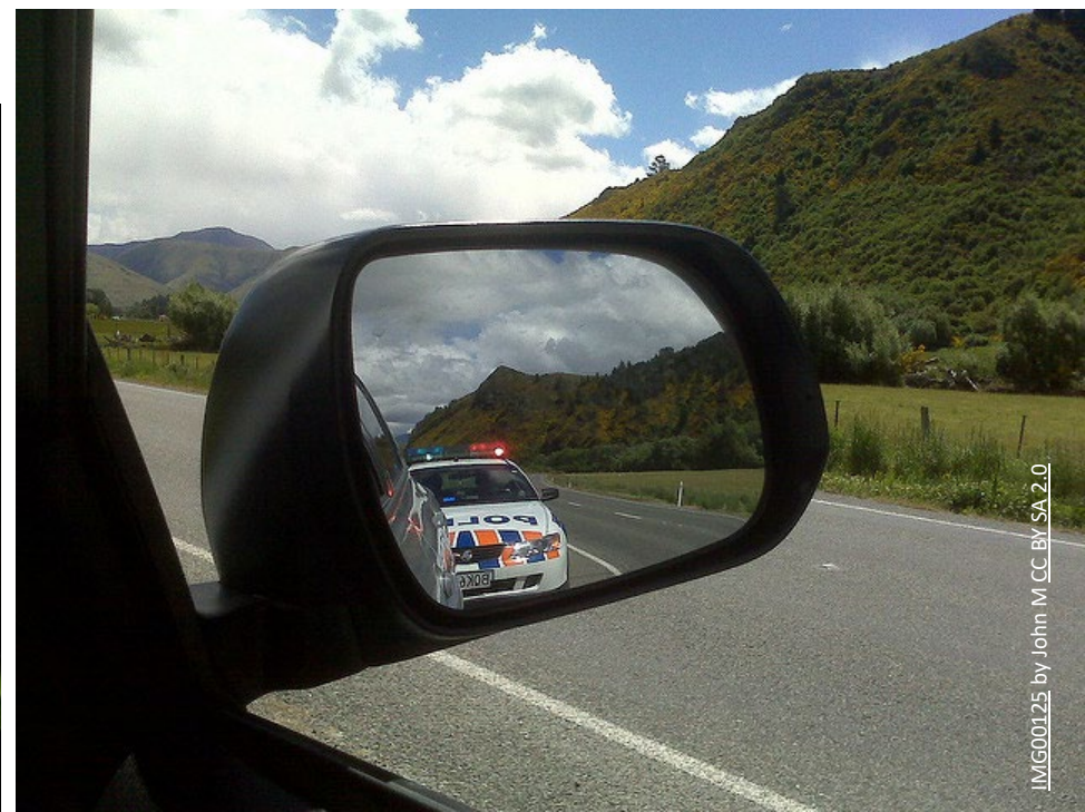
IMG00125